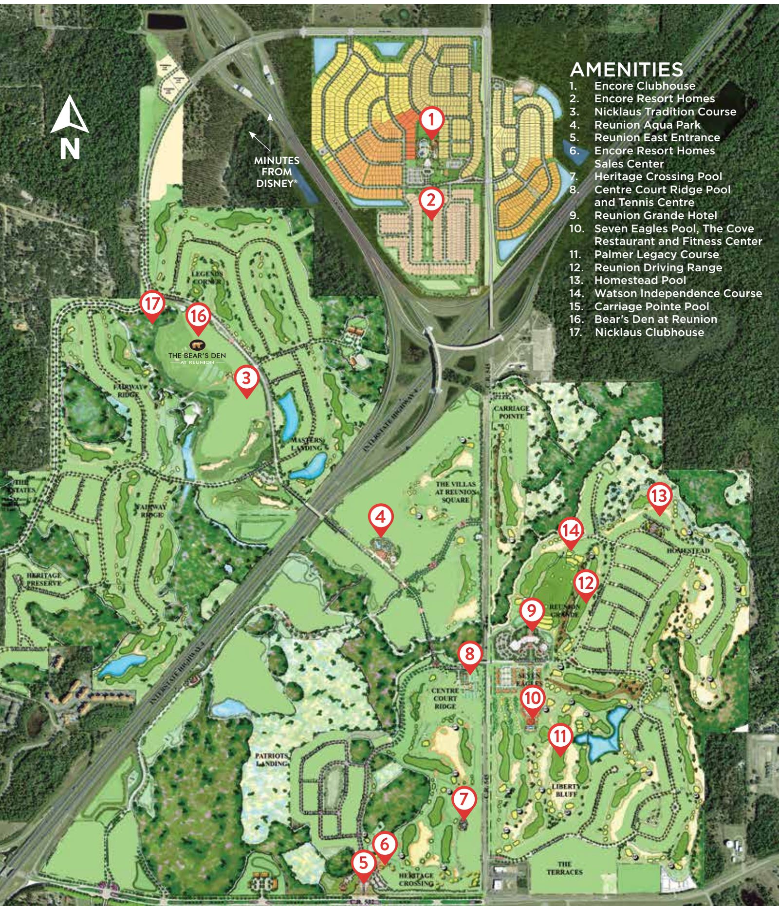
REUNION MASTER SITE PLAN